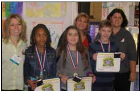
M-OCDS member volunteers with winners