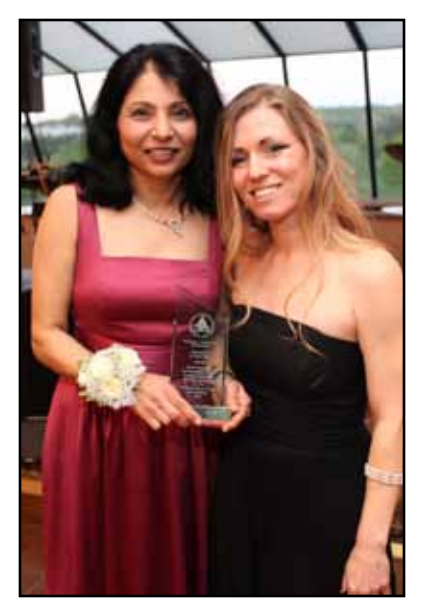
THE MONMOUTH - OCEAN COUNTY Dental Society President's Dinner Dance and Annual Officers' Installation