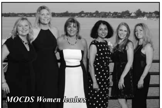
MOCDS Women leaders