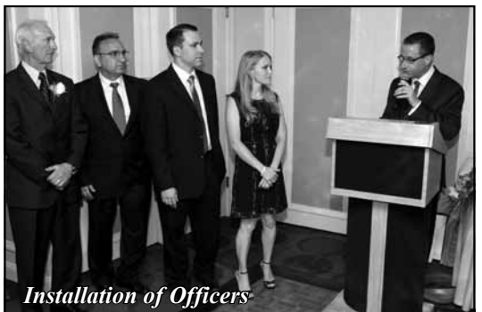
Installation of Officers