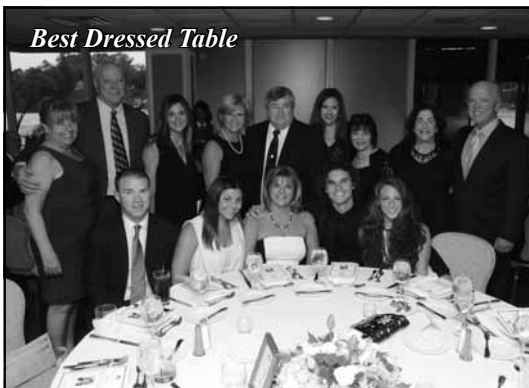
Best Dressed Table