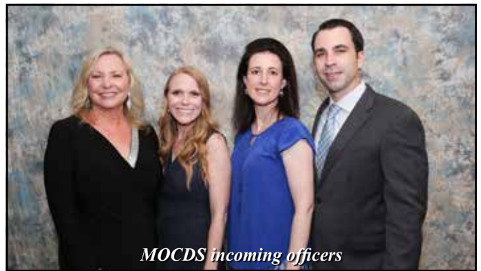
MOCDS incoming officers

“BE GOOD TO ONE ANOTHER.” Historians claim that those were the last words uttered by Nancy Hanks Lincoln on her deathbed. She was speaking to her nine year old son, Abraham and his older sister, Sarah. It's a matter of conjecture whether or not this actually happened. But what seems to be certain is that Abraham Lincoln was one of the most remarkable leaders of all time.