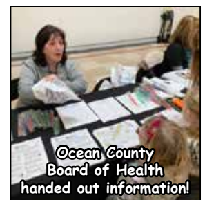
Ocean County Board of Health handed out information!