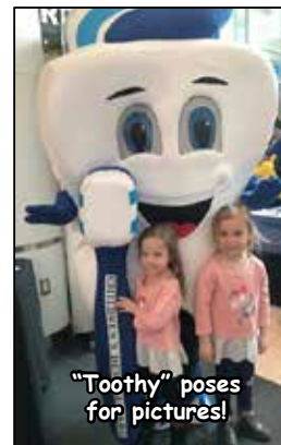
"Toothy" poses for pictures!