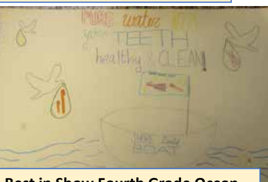
Best in Show Fourth Grade Ocean

Best in Show 1<sup>st</sup> Grade Monmouth