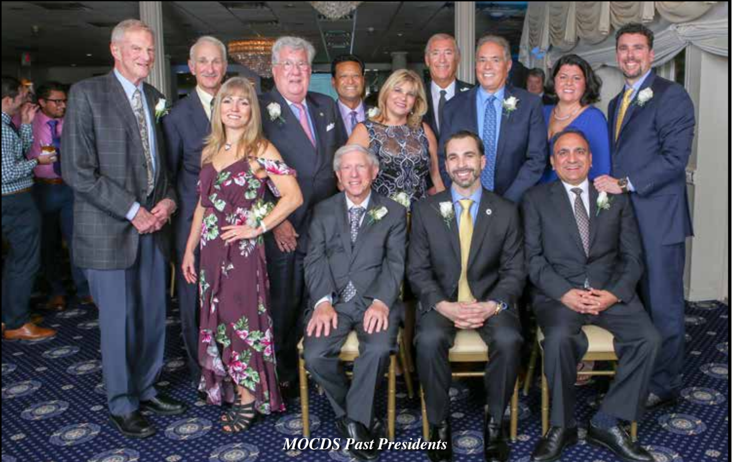
MOCDS Past Presidents