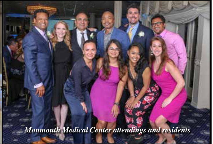
Monmouth Medical Center attendings and residents