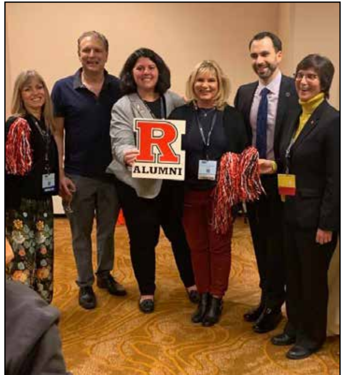
MOCDS members at the Rutgers School of Dental Medicine alumni gathering at New Jersey Dental Association annual session.

AFTCO TRANSITION CONSULTANTS AMERICAN PRACTICE CONSULTANTS ASTETO DENT LABS DENTAL FILLINGS OMEGA GRAPHICS