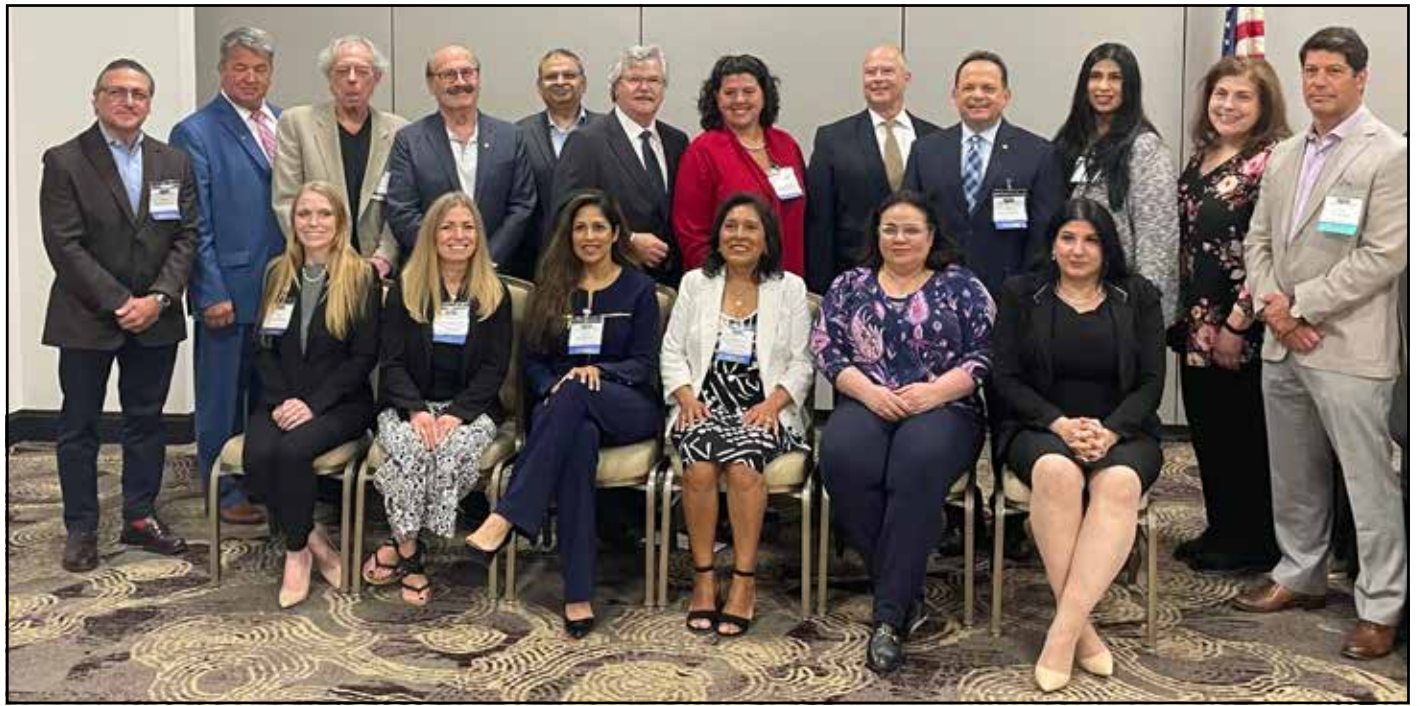
NJDA Trustees and Alternate Trustee 2022