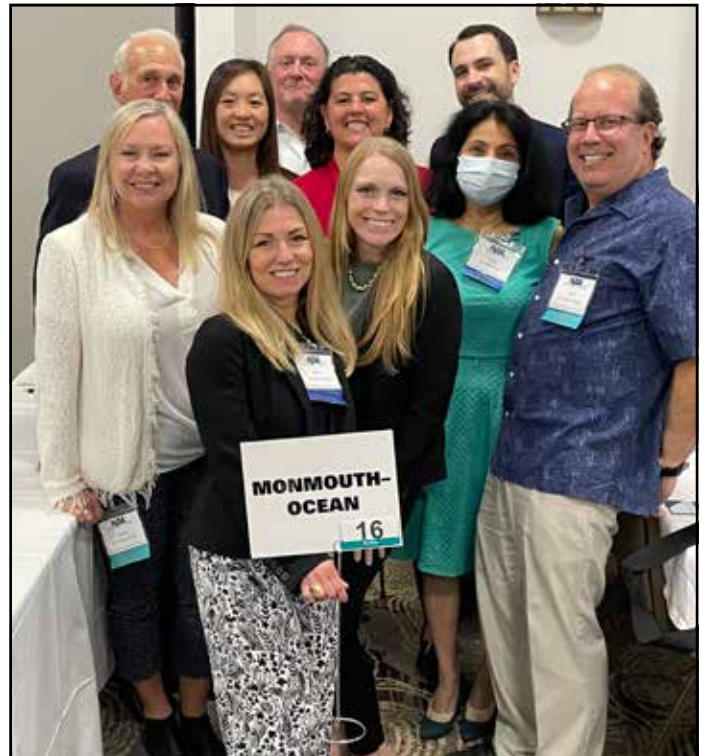
MOCDS Trustees and Delegates, June 2022