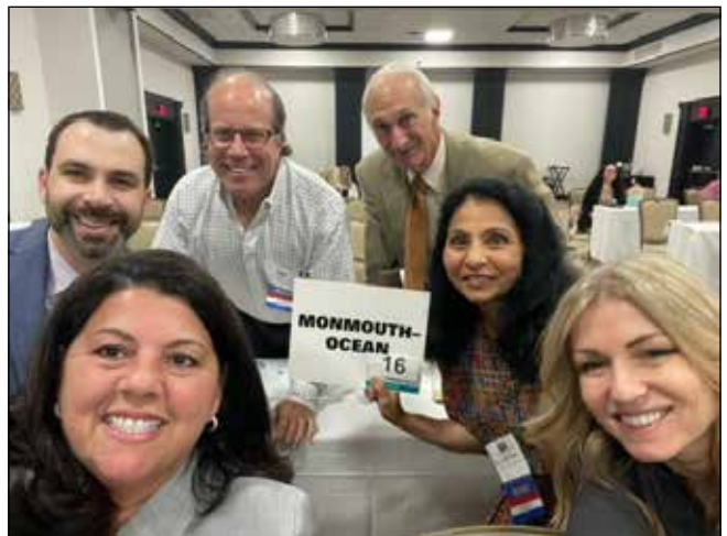
NJDA Annual Session of the House of Delegates