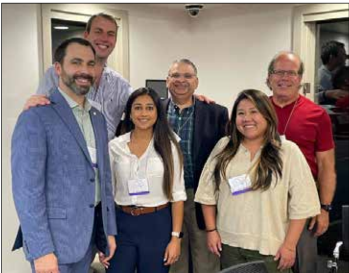
Cocktails and conversations panelists